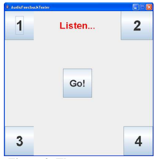
Figure 0. The system at start

The experiment was performed in a quiet sound-proof room to avoid any interruption and noise when listening to speech. A desktop computer running Windows with a usual mouse were available in the room and used for the experiment. The computer's speakers were used for the speech and volume level was set to highest. Glass walls on one side of the room allowed the experimenter to observe the participant without causing any distraction, however, when necessary the participant could talk to the experimenter and ask questions.